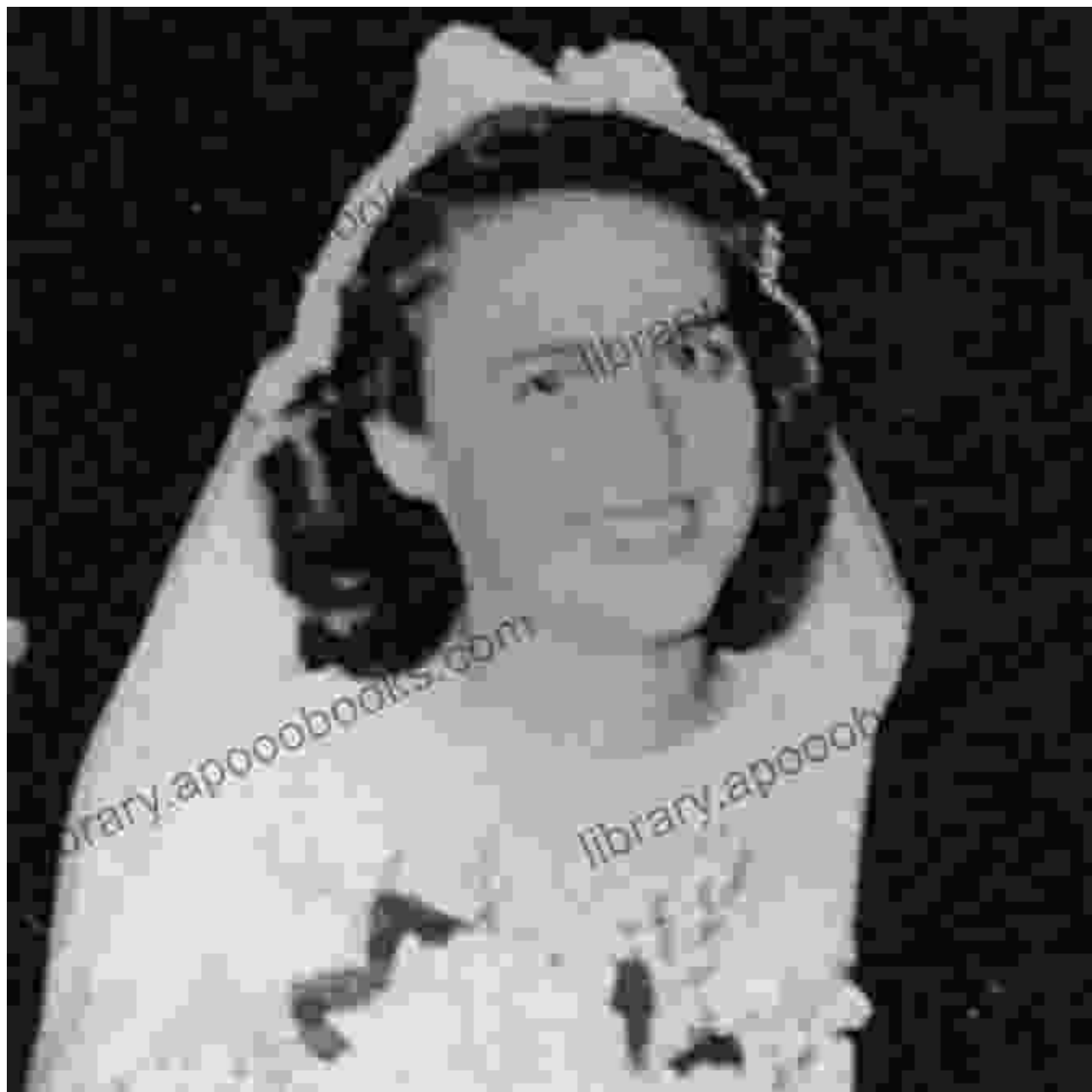
Barbara Bush, First Lady of the United States, 1989-1993.

Barbara Bush died in 2018 at the age of 92. She left behind a legacy of service, family, and love that continues to inspire Americans today. Her story is a testament to the power of one woman to make a difference in the world.