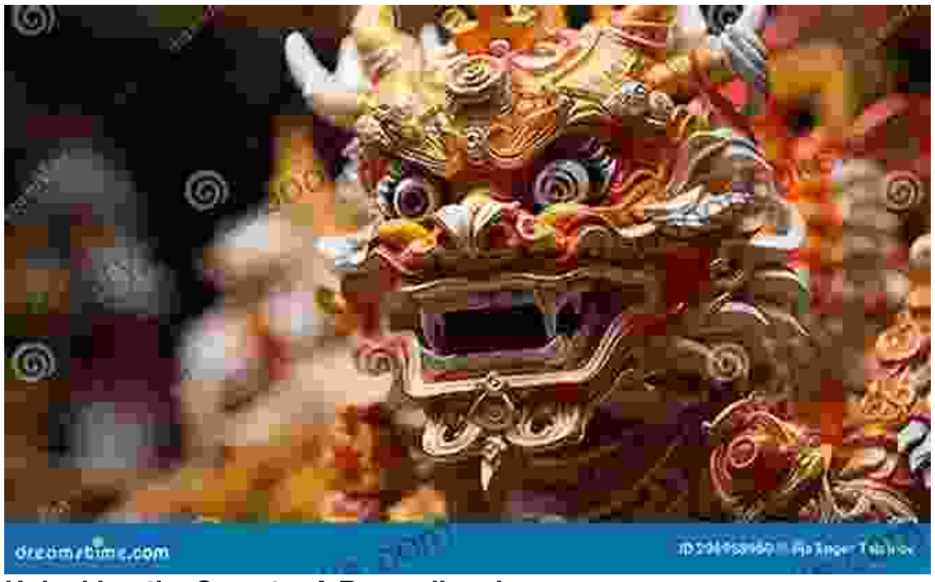
Unlocking the Secrets: A Rewarding Journey

Chinese Water Dragons offer a unique and rewarding companionship experience. By understanding their intricate care requirements, their fascinating behavior, and their captivating appearance, you can provide an exceptional life for your scaly friend. This comprehensive guide has equipped you with the knowledge and expertise to embark on this journey with confidence, creating a harmonious and thriving environment for your Chinese Water Dragon to flourish.