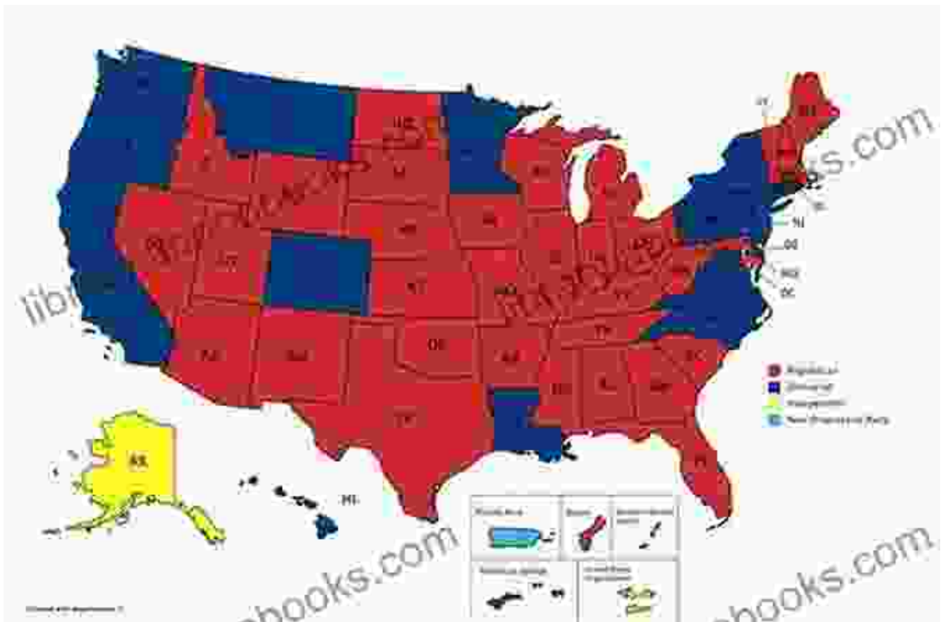
Party Affiliation in the American West in 2020