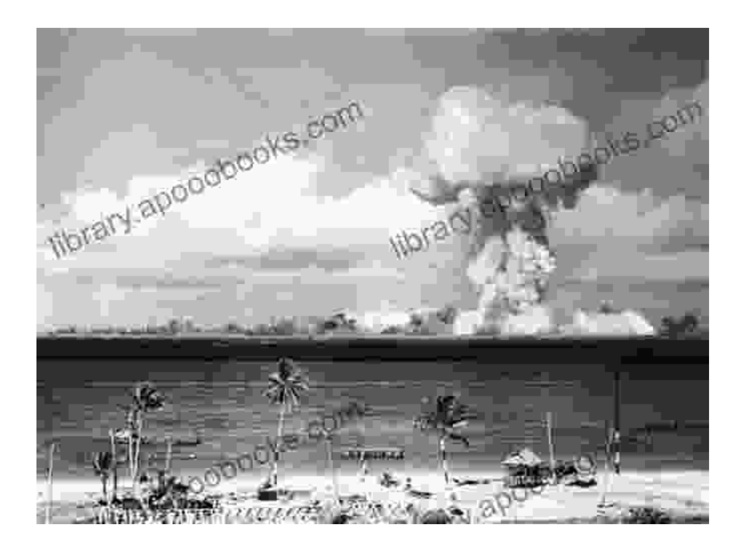
A mushroom cloud rising after a nuclear test on Kwajalein Atoll

indigenous Marshallese people, who had inhabited the atoll for centuries, were forcibly relocated to other islands, enduring severe hardship and displacement.