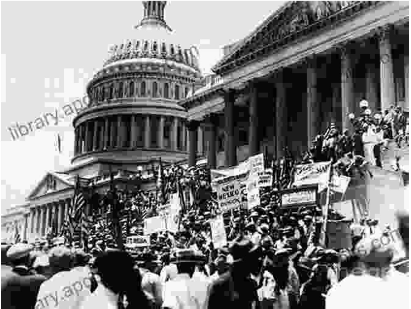
The World War Bonus Army marching on Washington, D.C., 1932